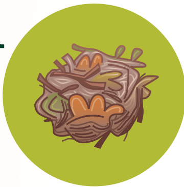
Tinder – small twigs, dry leaves or grass, dry needles.