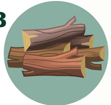
Firewood – larger, dry pieces of wood up to about 10" around.